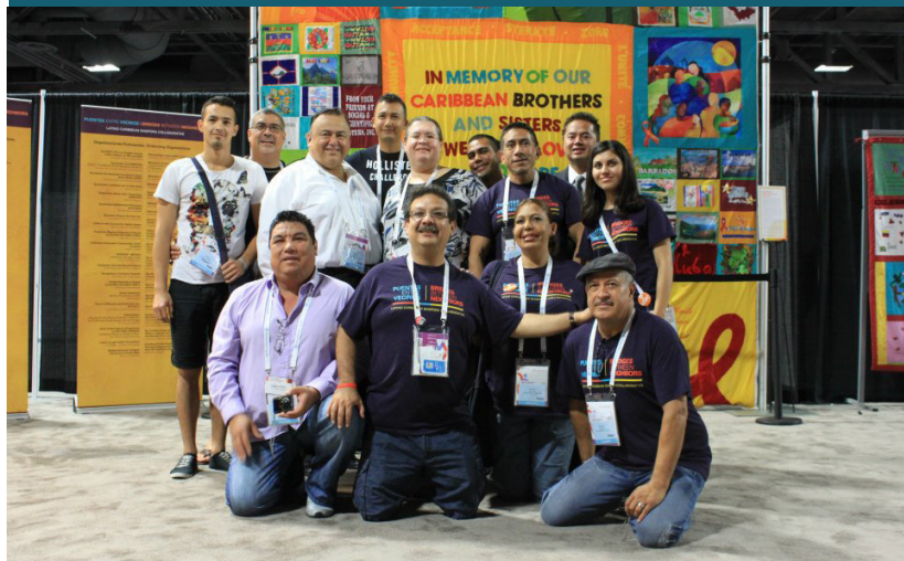
NLAAN members from BIENESTAR at the XIX International AIDS Conference

A recent study examining the demographic profile of people diagnosed with HIV in the U.S. across 46 states and five U.S. territories from 2007 through 2010 found that 42.2 percent of Latinos/Hispanics diagnosed with HIV were born outside of the U.S (Prosser, Tan, and Hall 2012). Compare to other racial/ethnics groups, Latinos/Hispanics accounted for the highest percentage of foreign-born individuals diagnosed with HIV. Anti-immigration laws could potentially perpetuate, if not exasperate, this disparity in HIV incidence among foreign-born Latinos/Hispanics since the fears, marginalization, and restrictions created by these laws have a profound effect on the emotional and physical health of immigrants as well as their likelihood to seek preventative medical services.