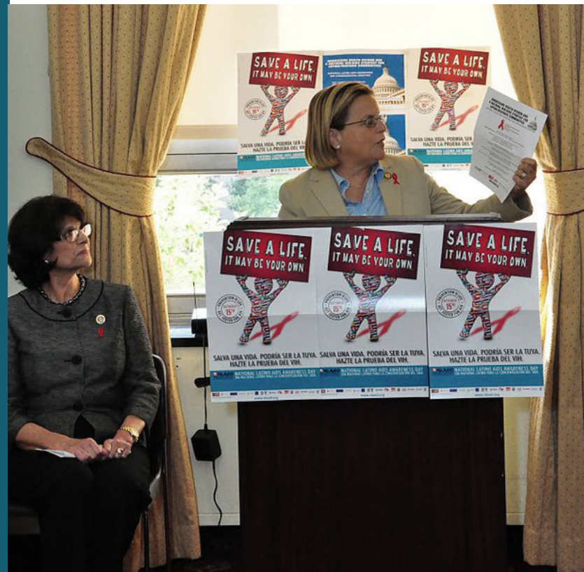
U.S. Congresswomen Lucille Roybal-Allard (CA-34) and Ileana Ros-Lehtinen (FL-18) at the 2010 National Latino AIDS Awareness Day Congressional Briefing