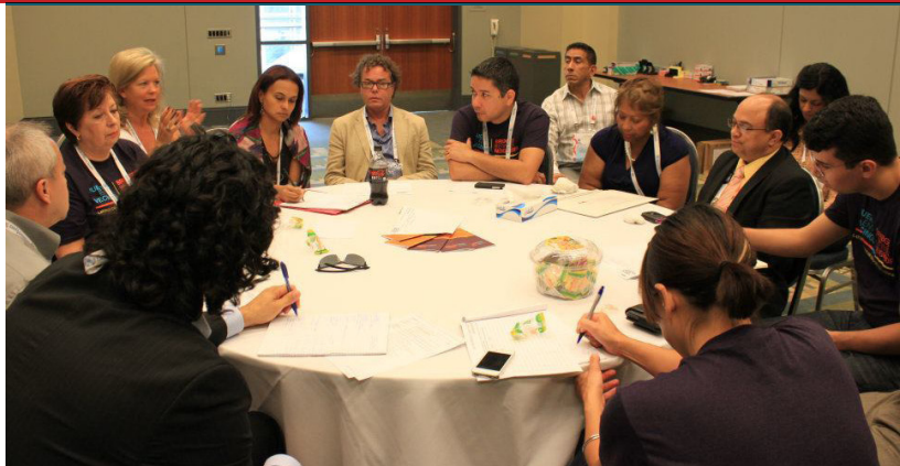
NLAAN Leadership Committee members working on the National Latino/Hispanic AIDS Action Agenda

It is with this understanding that the overarching goals of the National Latino/Hispanic HIV/AIDS Action Agenda are to prevent new HIV infections, adequately care for those living with HIV/AIDS, and address the intersectional realities that impact the health and lives for Latino/Hispanic communities. The Agenda offers specific action steps for each stakeholder in the fight against HIV/AIDS.