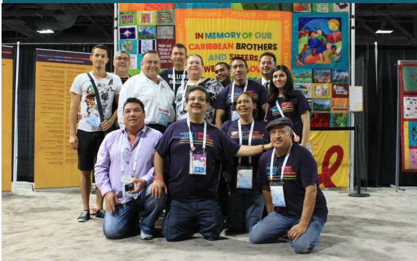
NLAAN members from BIENESTAR at the XIX International AIDS Conference

A recent study examining the demographic profile of people diagnosed with HIV in the U.S. across 46 states and five U.S. territories from 2007 through 2010 found that 42.2 percent of Latinos/Hispanics diagnosed with HIV were born outside of the U.S (Prosser, Tan, and Hall 2012). Compare to other racial/ethnic groups, Latinos/Hispanics accounted for the highest percentage of foreign-born individuals diagnosed with HIV. Anti-immigration laws could potentially perpetuate, if not exasperate, this disparity in HIV incidence among foreign-born Latinos/Hispanics since the fears, marginalization, and restrictions created by these laws have a profound effect on the emotional and physical health of immigrants as well as their likelihood to seek preventative medical services.