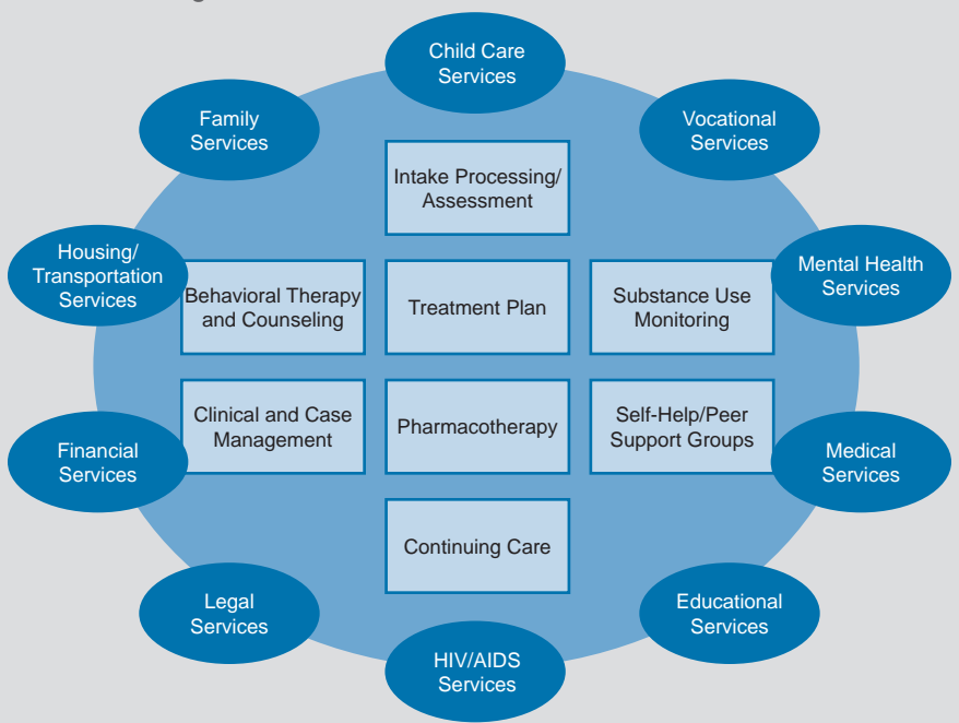
Figure 3: Components of Comprehensive Substance Abuse Treatment Program

Source: Adapted from the National Institute of Drug Abuse: Principles of Drug Addiction Treatment. Second Edition. 1999, revised April 2009.